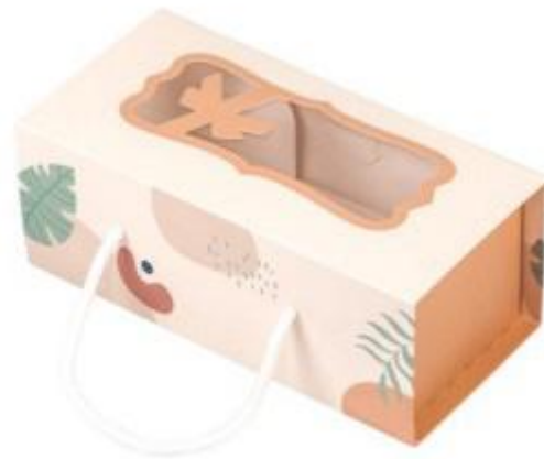
Sinst Printing Boxes with Plastic Handle for Shampoo Process